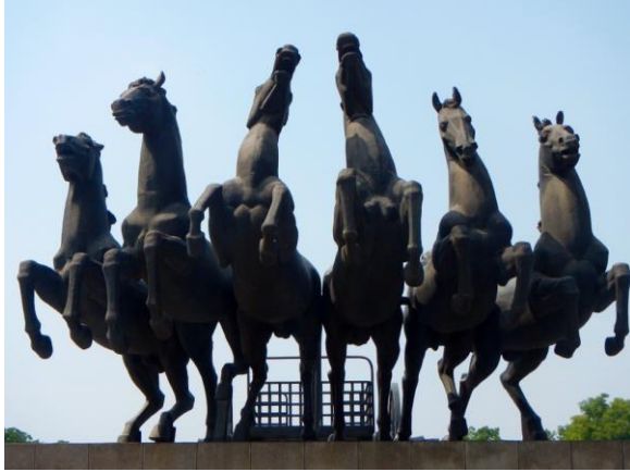
Emperor Carriage Museum

After lunch you will be escorted to Guanyu Temple , built to commemorate the great General Guan Yu of the State of Shu during the Three Kingdoms Period. Explore the only complex combining a forest with a temple in China, many believe that the head of General Guan Yu was buried here. The structure is comprised of halls, pavilions, temples and Guan Yu's tomb, valuable stone tablets with detailed calligraphies can be seen.