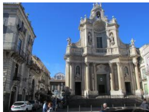
Piazza del Duomo

Visit the UNESCO World Heritage Site City Centre with the original baroque style and unique streets comprised of black lava stone. Your tour takes you to the Ancient Fish Market known as ‘ La Pescheria ’, the raucous market takes over the streets every workday morning, an amazing experience just behind Piazza del Duomo .