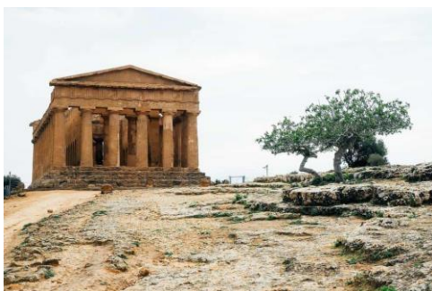
Valley of Temples

Breakfast at hotel, enjoy your full day city tour which covers Valley of the Temples , The Regional Archaeological Museum of Agrigento and a Walk via Athena .