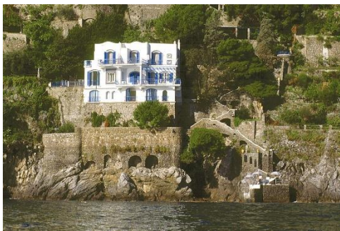
Villa San Michele

Next take a Walking Tour to Villa San Michele , a 19 th century structure built by a Swedish physician and author. Enjoy panoramic views of the town of Capri, Mount Vesuvius and the Sorrentine Peninsula from the villa's gardens. The area is adorned with relics and ancient Egyptian works of arts.