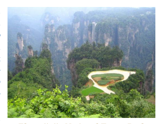
Zhangjiajie National Forest Park

We recommend a hearty breakfast as there will be much to see and do today, starting with Zhangjiajie National Forest Park. Welcome to China's first national forest park, established in 1982, spanning across 11,900 acres of land, part of a larger area known as Wulingyuan Scenic Area. Wulingyuan was recognized as a UNESCO World Heritage Site in 1992. Discover the pillar like formations that are seen throughout this peaceful area, we recommend checking out one of the quartz sandstone pillars known as the Southern Sky Column also known as Avatar