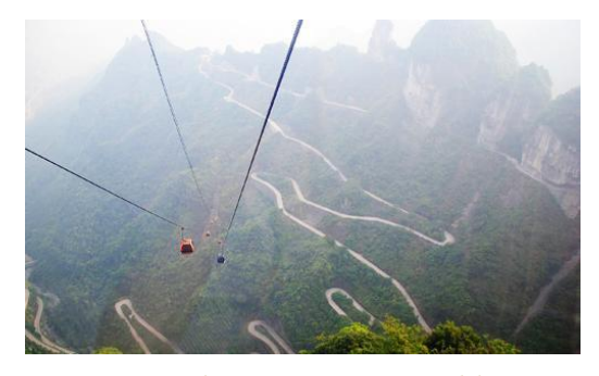
Tianmenshan Mountain Cableway

After your morning meal you will be driven to Zhangjiajie ( approx. 330 km / 4.5hrs ), your lunch will be included on the way. Upon your arrival take a wonderful ride on the longest one-way recycling passenger cableway in the world; Tianmenshan Mountain Cableway . Stretching across 7455 meters and a height gap of 1279 meters you will get a great view of the modern city on the way to the top of the mountain. Watch how the landscape transforms by your window.