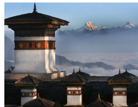
Dochu La Pass